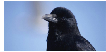
5S bird of the month is the crow